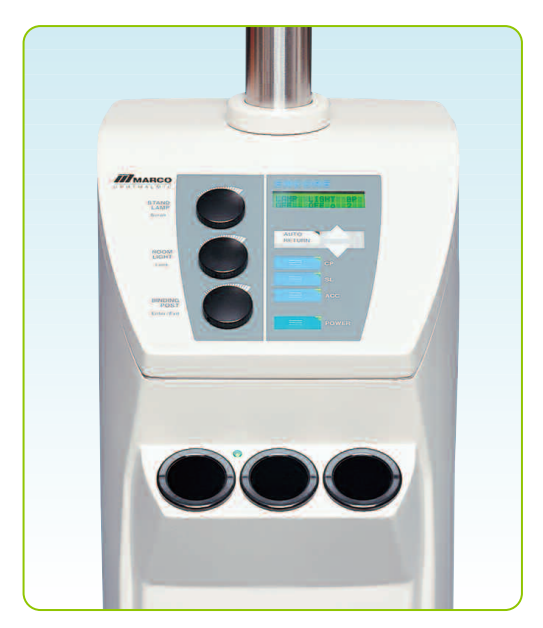
Stock #1290 – Limited programmability controls only the Stand Lamp.

Stock #1291 – Full perc programmability controls Overhead Room Lights and Stand Lamp.