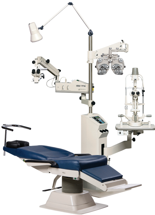
Encore Automatic Chair in fully reclined position with Surgical Package installed

Easy, “dial-in” programming control with safety switch to disable chair operation