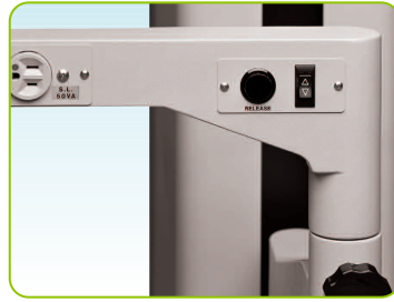
Deluxe 2 Lower Slit Lamp Arm

The industry's standard in efficient, instrument-delivery systems just got better. The new modern DELUXE 2 STAND clearly offers more pure quality and cosmetic appeal than any other instrument stand on the market. Innovative features such as an electronic slit lamp arm release button, overhead room light switch, and a laborious ten-step hand-finished painting process make the Deluxe 2 Stand a unique and differentiated product. While maintaining our usual high standards of function, quality and durability, the new Deluxe 2 Stand also remains competitively priced. For a compelling side-by-side demonstration against any other instrument stand, contact your local authorized Marco distributor.