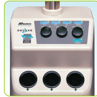
Deluxe 2 Stand full-featured instrument control panel, Stock #1206