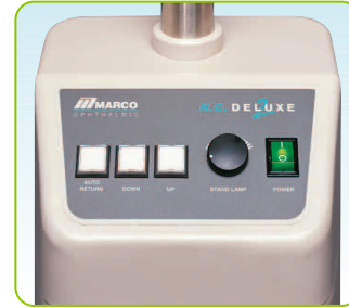
Non-console Deluxe 2 Stand instrument control panel, Stock #1213